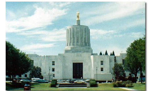
Picture of the Oregon Capitol